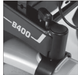
EF 03 Mechanical caster wheel swivel lock