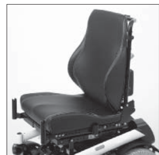
EC 24 Contour seat with deep contours EC 26 Synthetic leather cover

The number codes contained in this order form are not intended to be used as article numbers for spare parts orders. Please use the spare parts catalogue for spare parts orders.